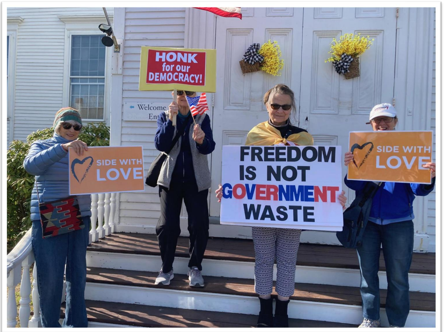
Demonstrators on the church steps.